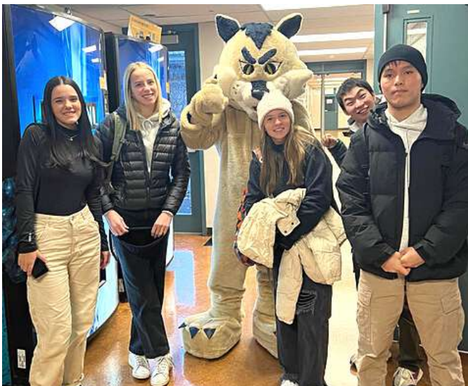
New students at our February 2024 orientation posing with the Westview Wildcat!

If you are interested in hosting short-term students or can refer someone please reach out to your Homestay Coordinator!