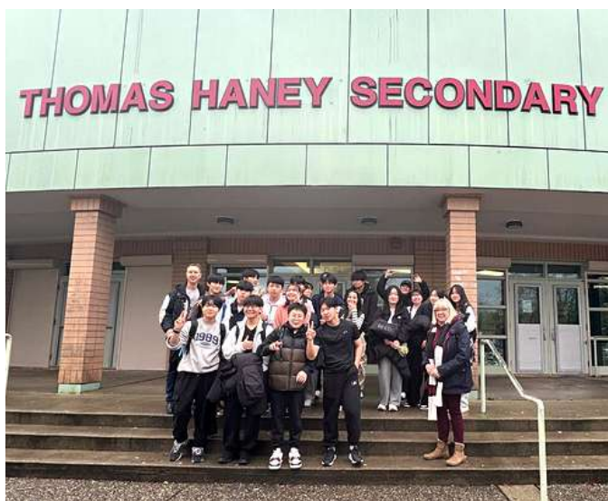
Winter 2024 short-term group from Korea checking out all that Thomas Haney Secondary offers.