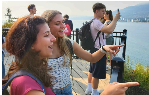
Students from our September intake enjoying the beautiful Vancouver views.

Homestay Coordinators will be in touch in the coming weeks to offer student placements for September students. Some new students will arrive for our Pre-Academic program starting Aug. 17, but most will arrive Sept. 1-5. The first day of orientation and new classes will be Tuesday, September 8.